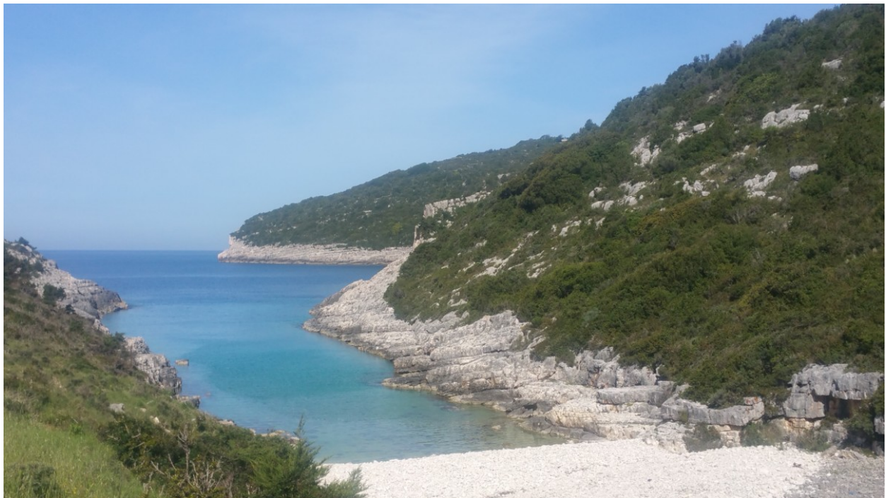
Peninsula for sale