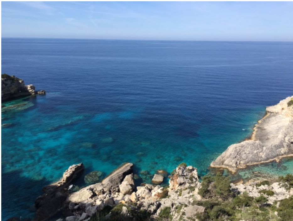
Peninsula for sale