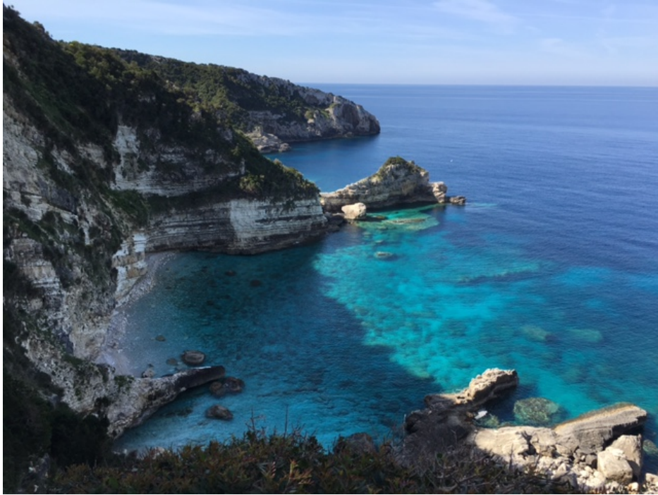
Peninsula for sale