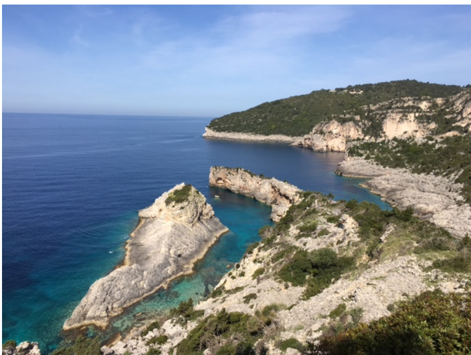
Peninsula for sale