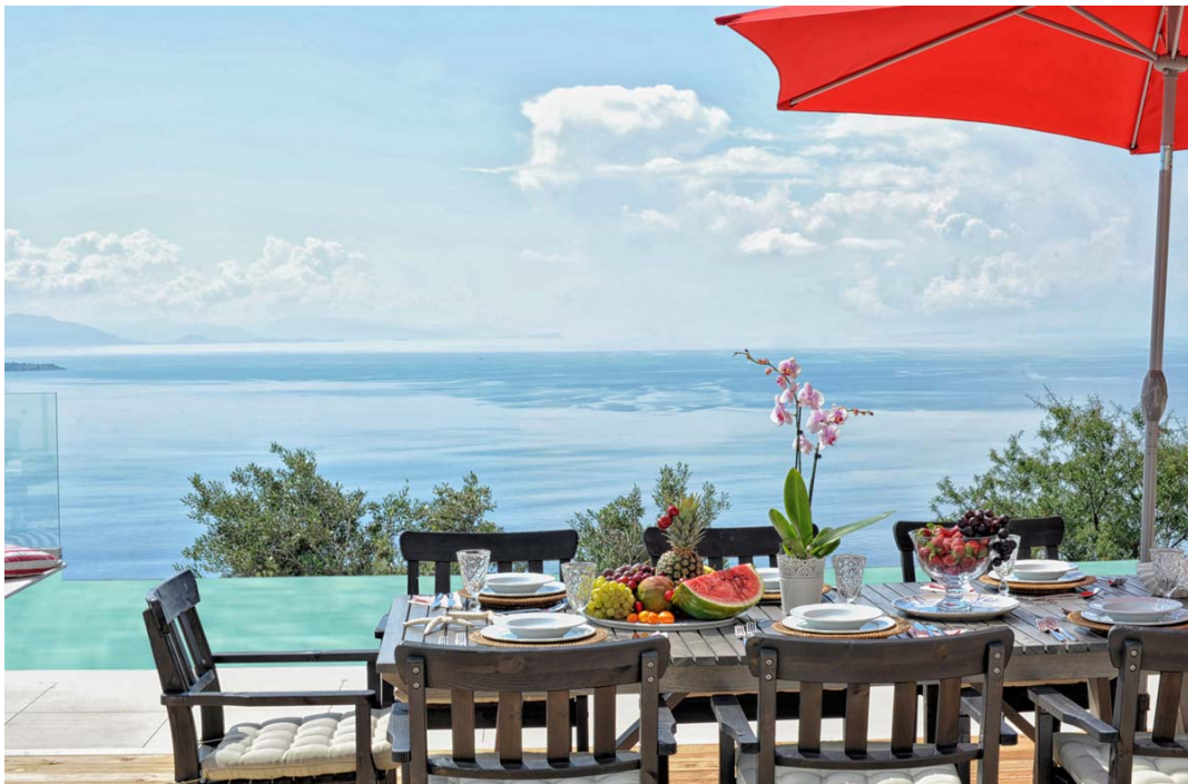
Villa Sky View