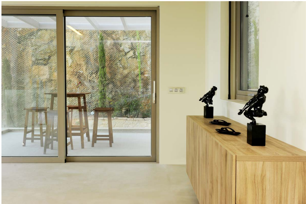
Villa Sky View