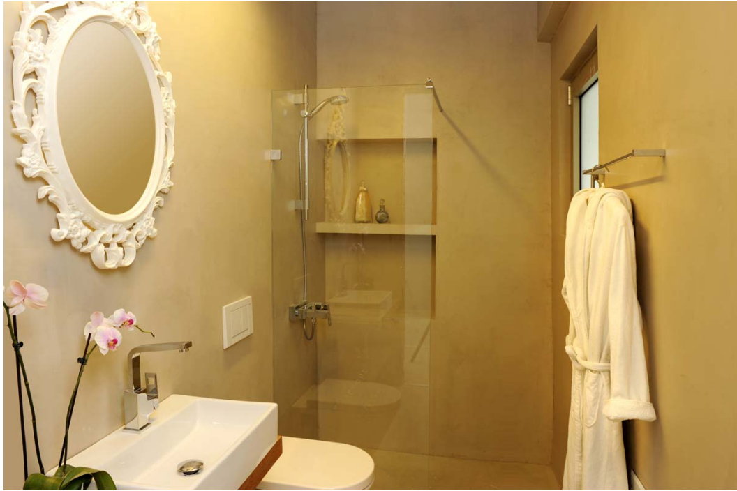
Villa Sky View